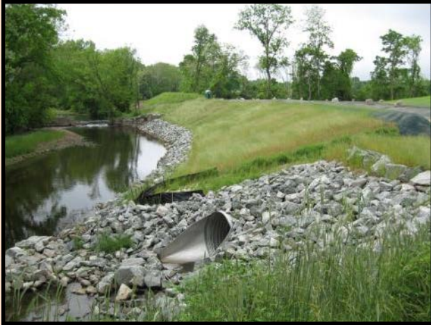
View from Sons of Italy parking lot