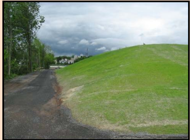
View of reservoir side of the Pile