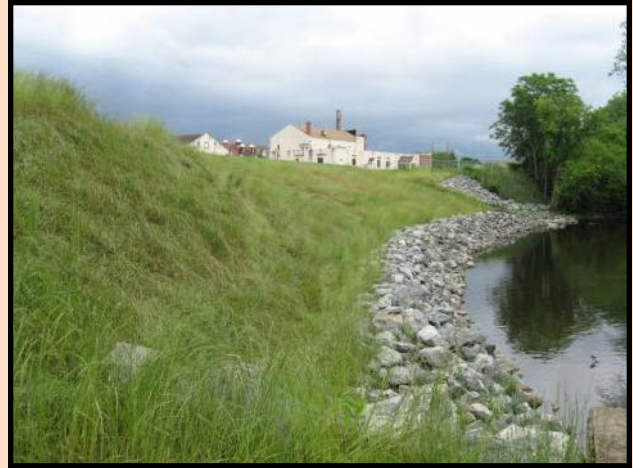
View from old dam in Wissahickon Creek