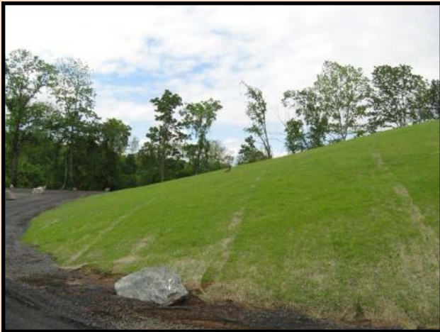
View of back portion of the Pile